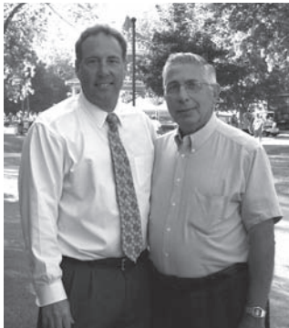
Senator Robach & Fred

I am pleased that we were able to upgrade our computers and presentation equipment with a grant from Senator Joseph Robach. This grant also allowed us to purchase museum software which is helping us inventory and document all of our museum treasures.